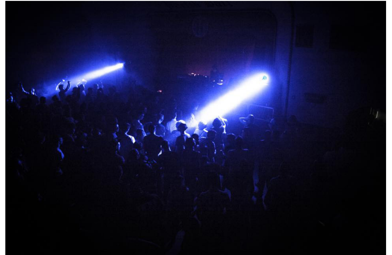
Sanctuary It's Not U It's Me / Long Winter May 20, 2016 Sts Cyril & Methody Church 237 Sackville St