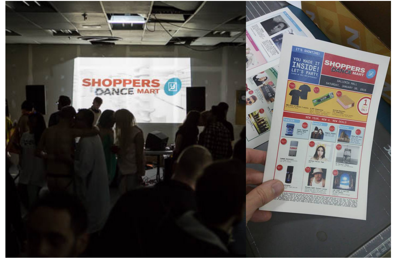
Shoppers Dance Mart It's Not U It's Me / Long Winter January 30, 2016 Galleria Mall