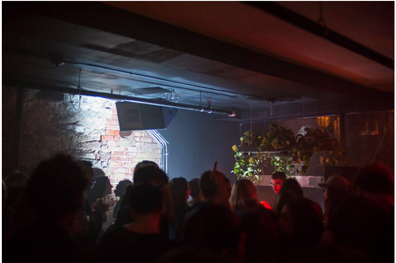
Split Personalities It's Not U It's Me January 15, 2016 Bambi's / 76A Geary