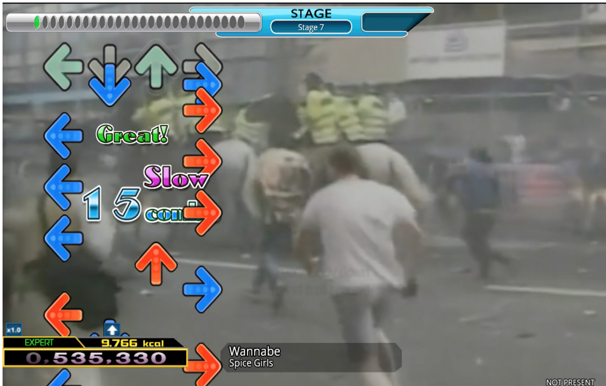
Alvin Luong, I can't stand the hangover so let's just play DDR

I can't stand the hangover so let's just play DDR