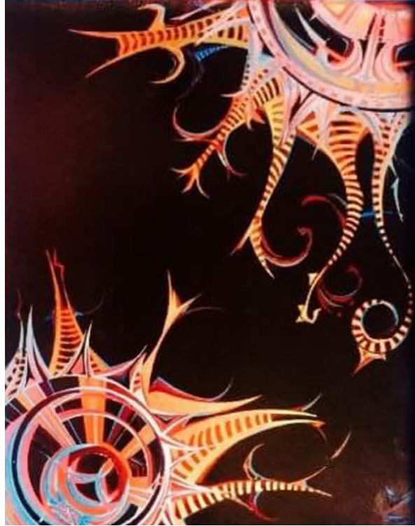
NAI SAMMON, Groping in the Blackness of Space