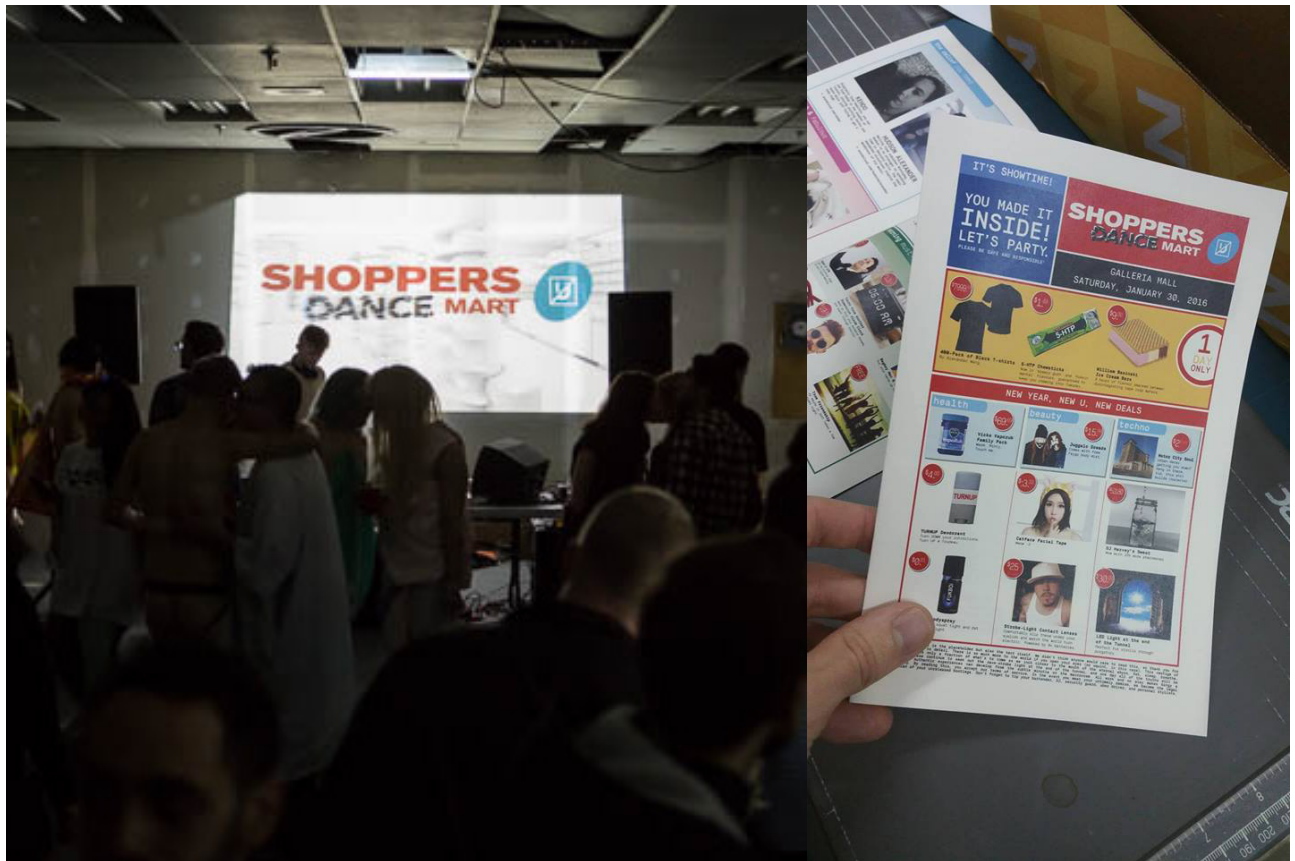
Shoppers Dance Mart It's Not U It's Me / Long Winter January 30, 2016 Galleria Mall